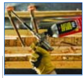
Fireplace gas line

®™Trademark of The Dow Chemical Company ("Dow") or an affiliated company of Dow * For gaps and cracks greater than 3", use FROTH-PAK™ FS Foam Insulation Kit or FROTH-PAK™ Foam Sealant Kit. ** Estimated yield under ideal conditions based on gun foam, 3/8" bead.