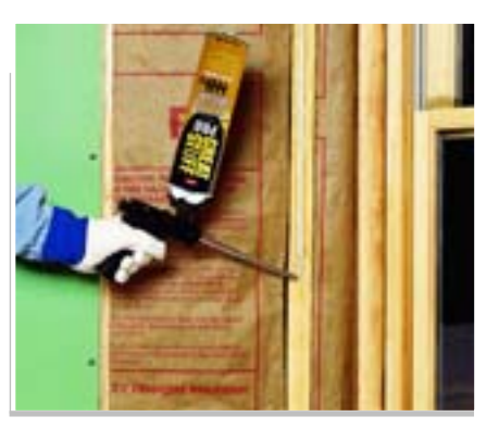
Reduce nail pops in drywall attachment and use fewer fasteners with GREAT STUFF PRO™ Wall & Floor Adhesive.