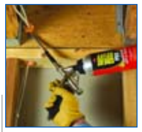
Electrical wire penetration