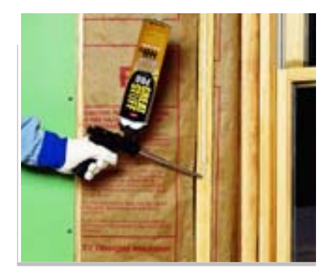
Reduce nail pops in drywall attachment and use fewer fasteners with GREAT STUFF PRO™ Wall & Floor Adhesive.